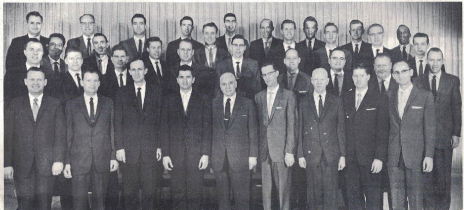
The ministers (above) who attended last year's conference will be augmented by those newly ordained, for this year's momentous and significant meeting.

We are very happy to have you back with us even if only for a while. We know that we must share the joy of your presence with God's people in other lands. Our welcome is saddened, somewhat, realizing you may soon be off to England. Since your tentative plans include a return to the British Isles by Passover, we take this opportunity to let the British Brethren know how much we love them: we feel less sad at your leaving when we realize you will bring them the same spark, drive and inspiration you have brought us.